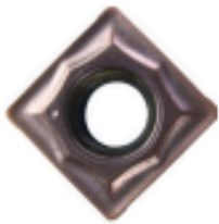
IP30 - Steels