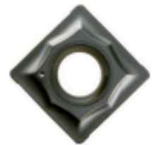
IN10 - Aluminum