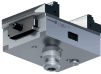
Mounting with quick-change clamping system**