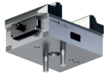
Mounting position arranged with two fitting screws