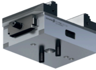
Mounting with two screws